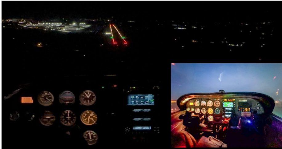
Civil Air Patrol With an ever-present mission, the CAP must always be ready, day or night, to meet mission needs. Night flying presents some awesome sights for flyers! Photos: TX-645